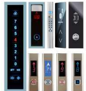
CAR AND LANDING OPERATING PANEL